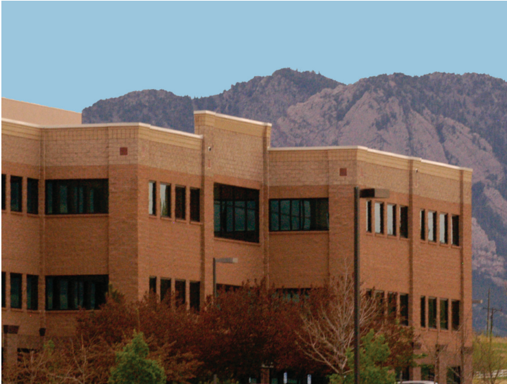
Centennial Valley Business Park