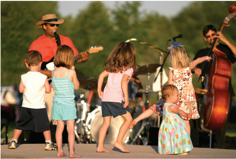
Summer Concert Series