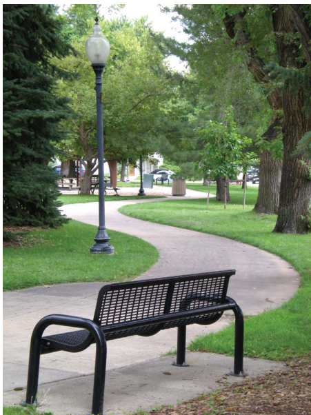
Memory Square Park