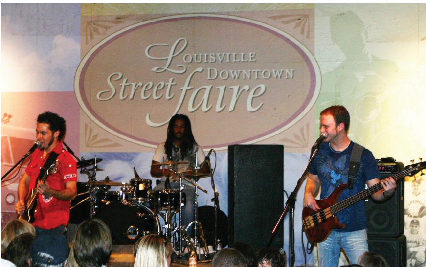
Louisville Downtown Street Faire

Business Registration & Licensing - For information regarding business registration and the sales tax process, please visit www.louisvilleco.gov or call 303.335.4514.