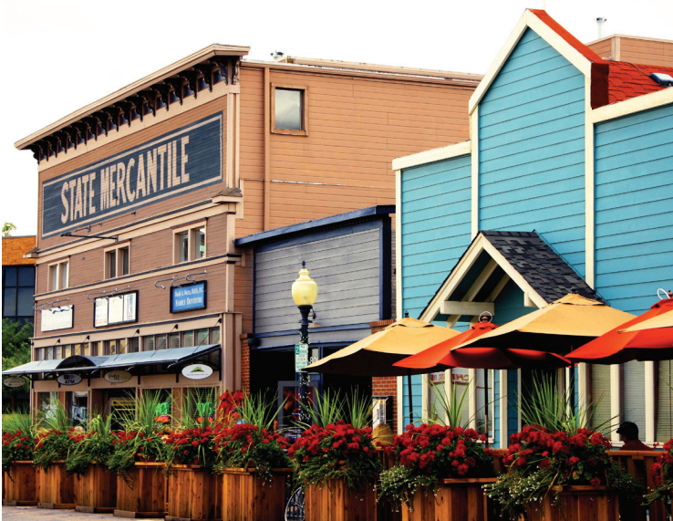
Historic Downtown Louisville