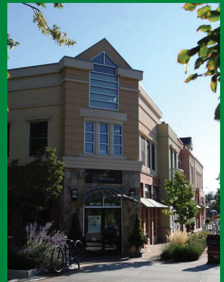
Front Street, Downtown Louisville