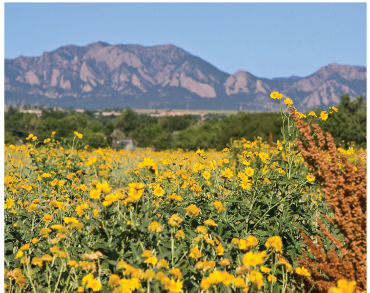
View from the Colorado Tech Center