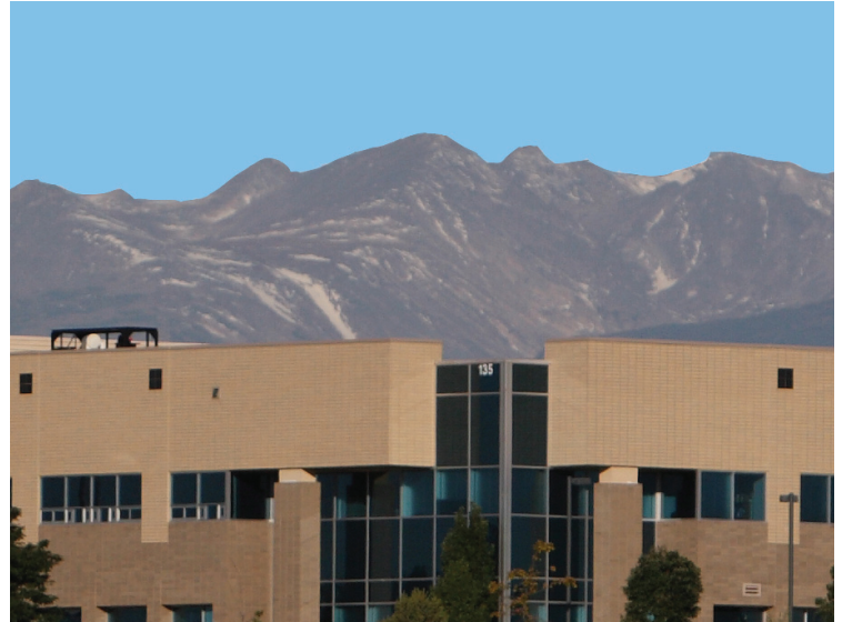
Colorado Tech Center