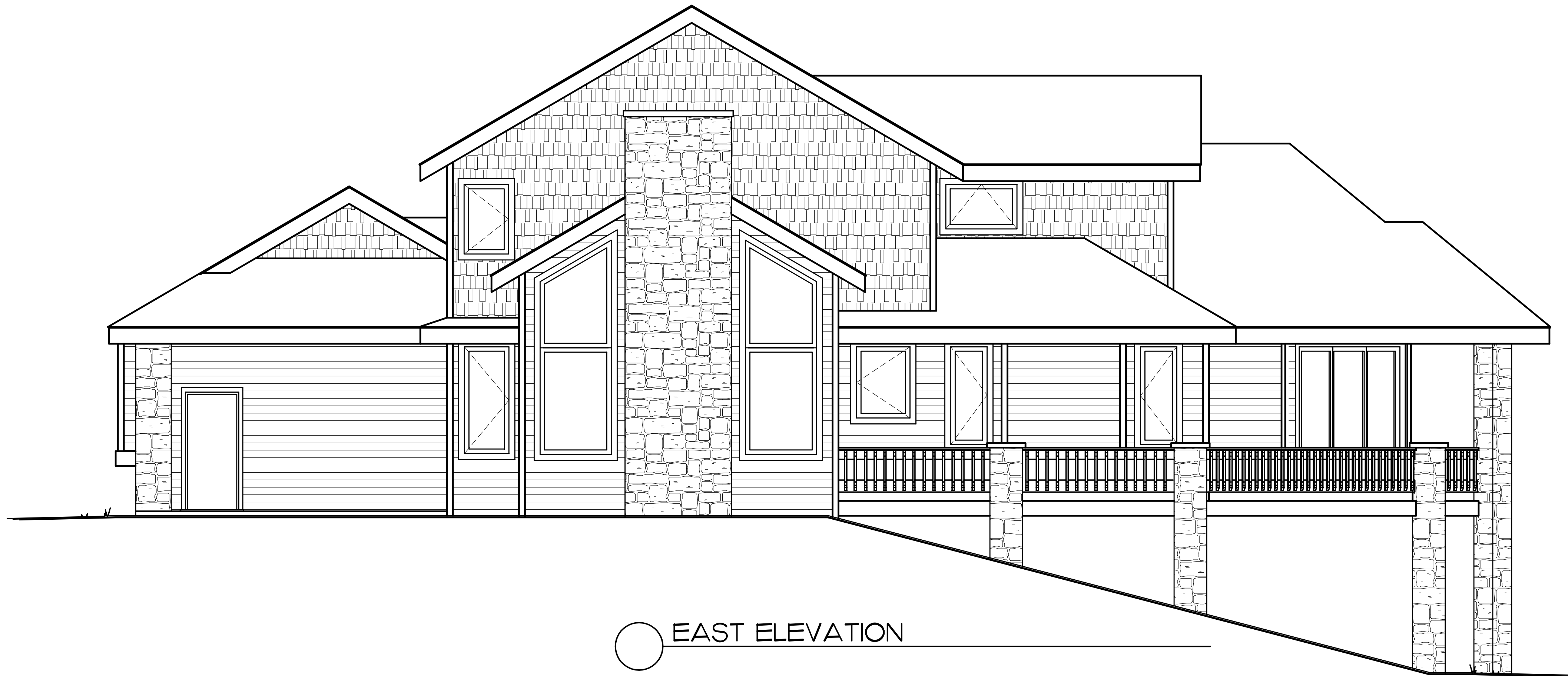
○ EAST ELEVATION