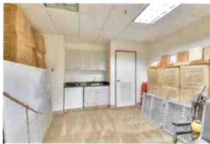
Office #1 (10X12)

Break room with kitchenette featuring granite countertops and refrigerator (16X11)